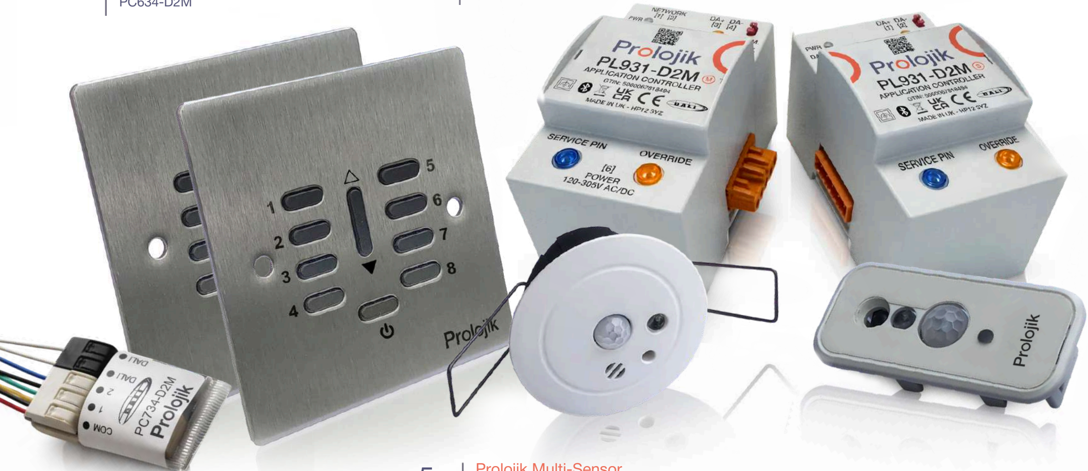
4 | Prolojik Switch Interface PC734-D2M