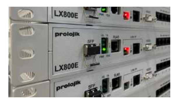
In total, Arm ABCD contains 70 LX848 switches internetworked between eight IDF

Our in -house design team scheduled all data cabling to ensure optimum loading and our engineering team worked closely with Bancroft's cabling provider TCG to deliver a clear and traceable patching architecture. The resulting installation is both simpler to manage and is modular for future changes.